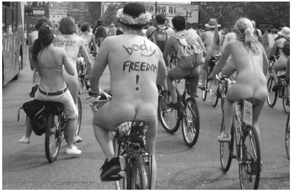
Cheering up the London streets

Things like this indicate that the ride organisers have to be flexible and adjust accordingly to achieve the maximum result of getting the message across, avoiding unnecessary conflicts that deviate from the cause at hand. As Bedno puts it, "police were hard on us in the first years, then we worked with them; communication was impossible once the ride got big, then we added radios; cost was a problem, then we found donors,