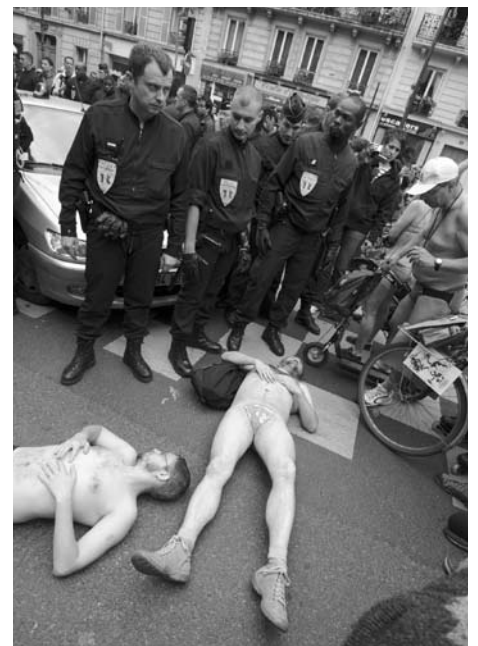
The Paris ride faced considerable problems with the police